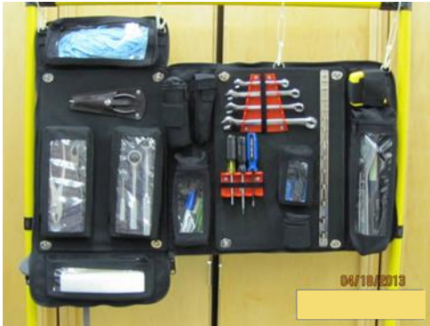
Visually Designed Tool Applications